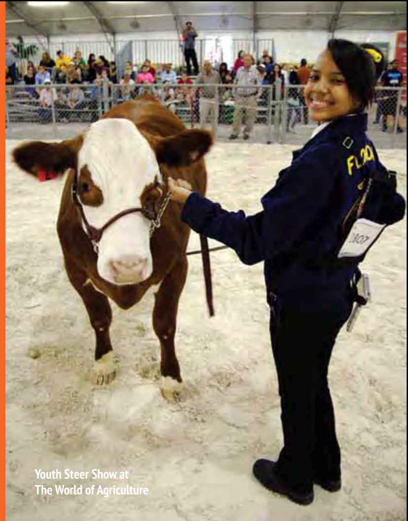
Youth Steer Show at The World of Agriculture

The Miami-Dade County Fair & Exposition, Inc. is a private, not-for-profit organization dedicated to enriching our community by promoting education and South Florida agriculture while showcasing and rewarding youth achievement. We accomplish this by producing a first-class Fair with quality entertainment and providing facilities & resources for year-round events.