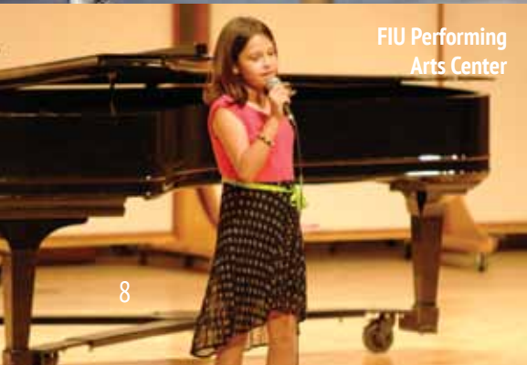
FIU Performing Arts Center