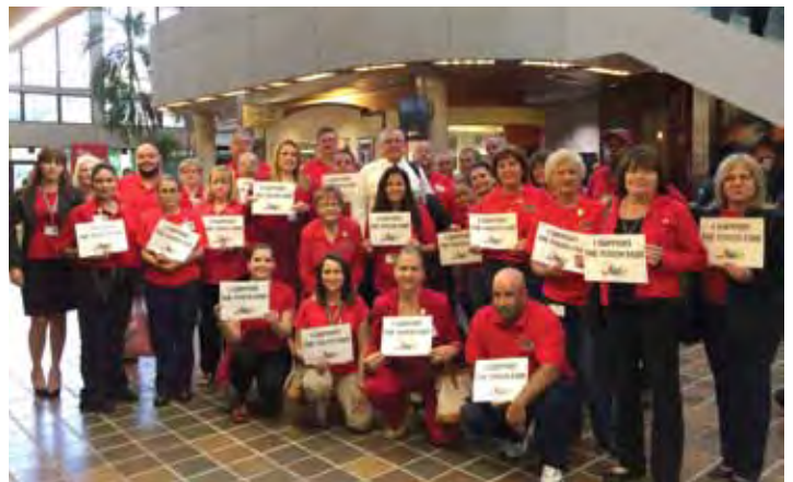
CHAMPIONS FOR THE YOUTH FAIR: Friends of the Youth Fair showed their support when they went to the the Sept. 3, 2014, meeting of the Miami-Dade County Commission.

Standing as proof of their achievements are eight awards brought home from the International Association of Fairs and Expositions (IAFE) annual competition. The rest of the year they take on myriad tasks: market Expo opportunities, reach out to youth, organize sports events, research scholarships, maintain 86 acres of grounds, and embrace business flexibility in a world of fluctuation.