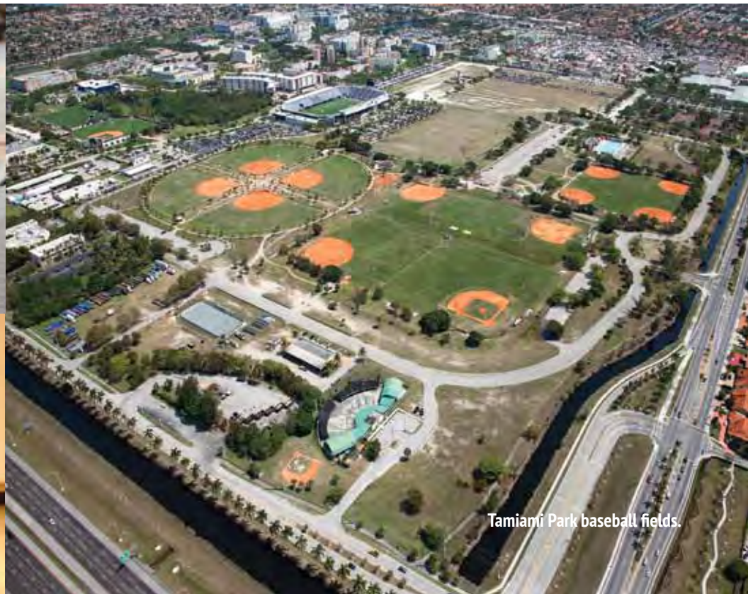
Tamiami Park baseball fields.